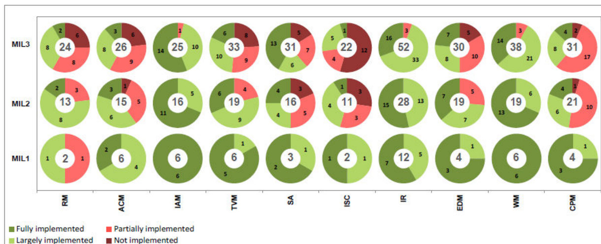
Figure 3. Domain View Example

In the Domain view, the number in the center of the doughnut indicates the cumulative number of questions that must be answered “Largely Implemented” or “Fully Implemented” to achieve that MIL for that domain. For the full list of domain names and abbreviations, see Table 7.