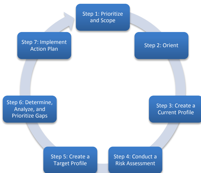
Figure 1. Framework Implementation Approach

Each step is introduced by a table describing the step’s inputs, activities, and outputs. Additional explanation is provided below each table. A summary table of the inputs, activities, and outputs for each step is included in Appendix B.